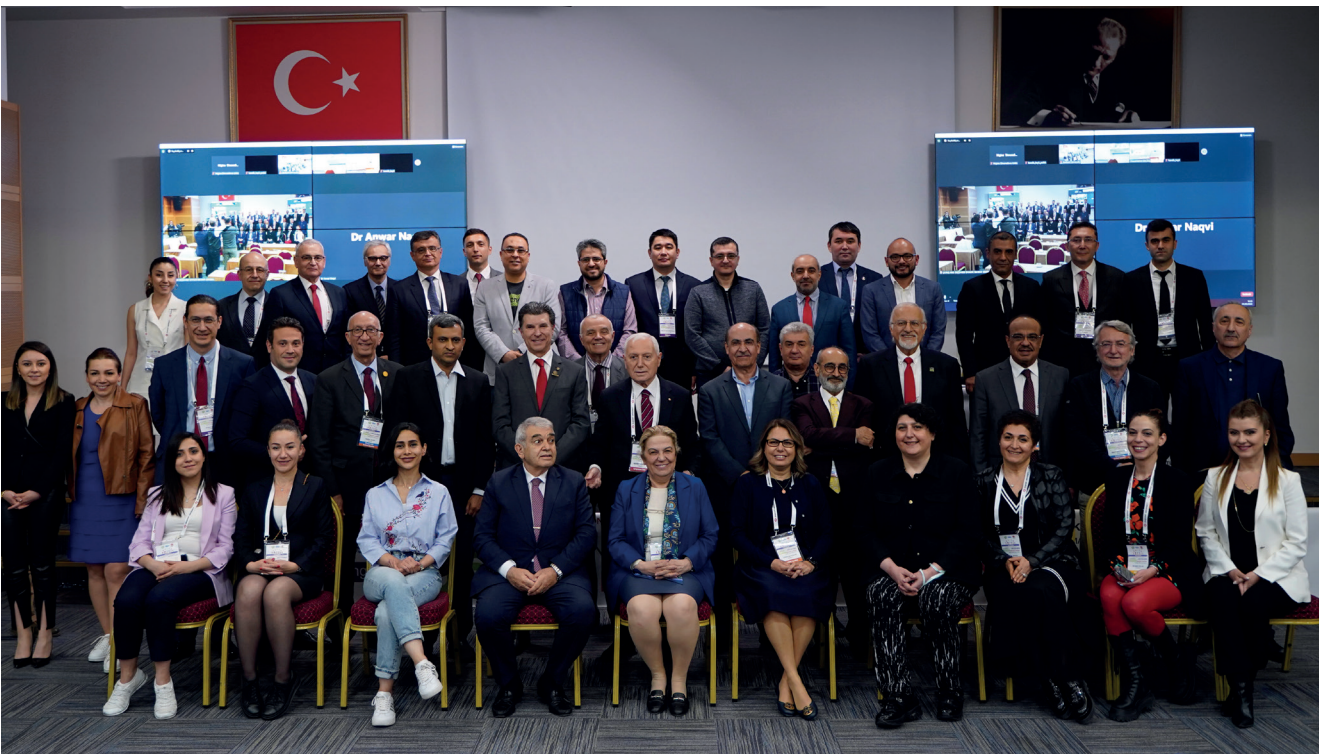
Photo taken during the Closing Ceremony