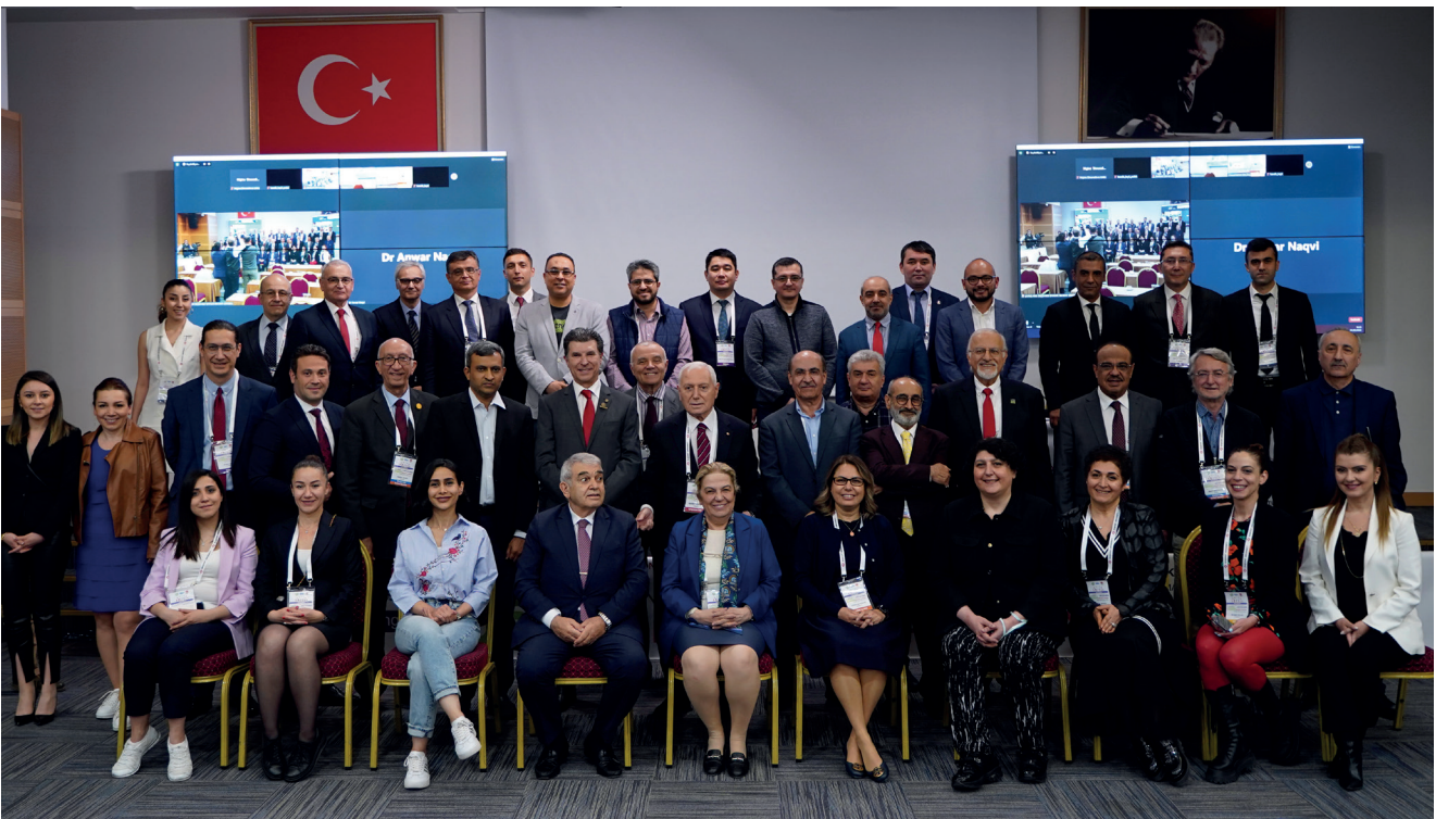
Photo taken during the Closing Ceremony