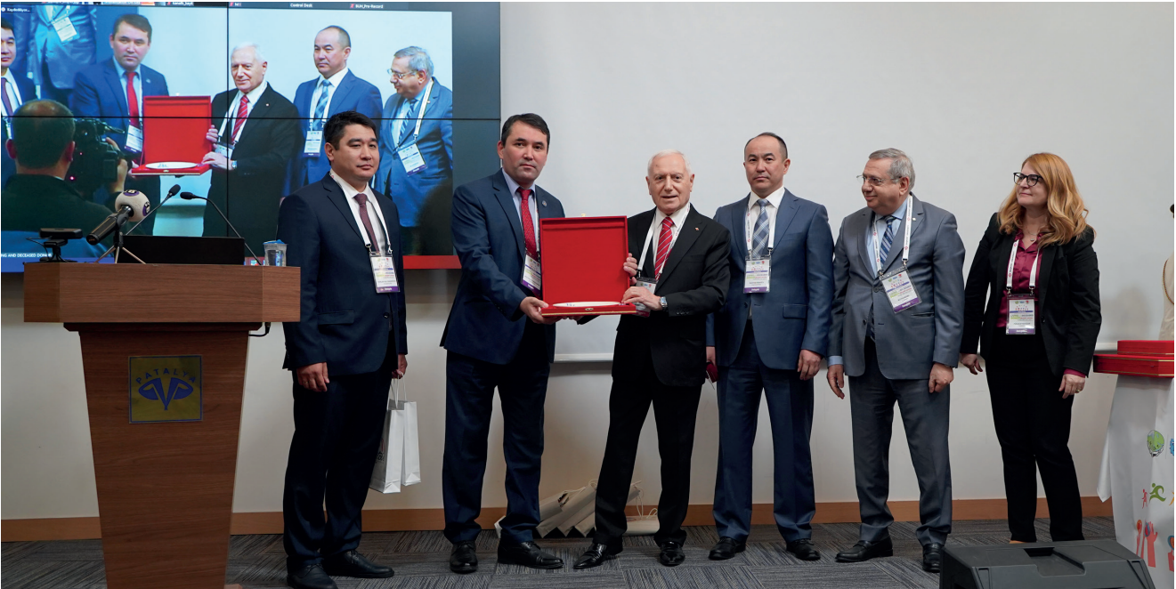
Memorandum of Cooperation between Health Department of Aktobe Region (Aktobe, Republic of Kazakhstan) and Başkent University (Ankara, Republic of Turkey)