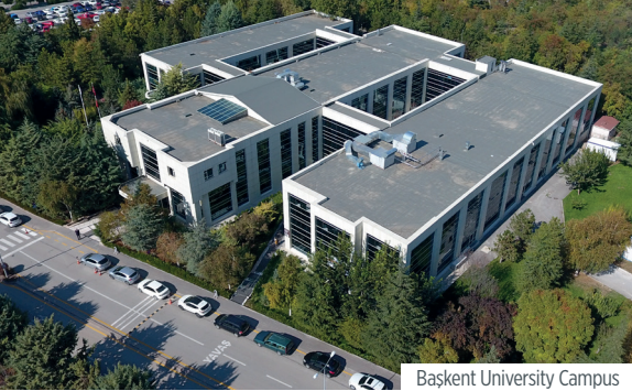
Başkent University Campus