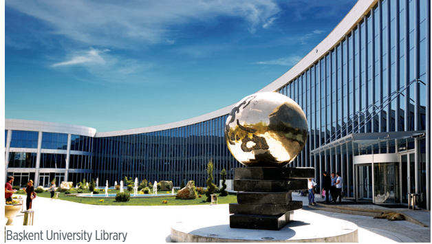
Başkent University Library