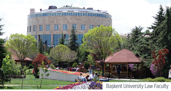
Başkent University Law Faculty