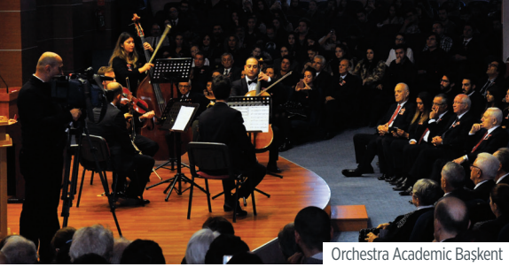
Orchestra Academic Başkent