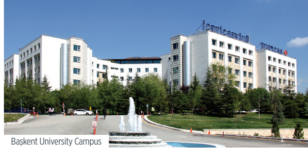
Başkent University Campus